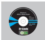
CD-ROM (D-Link Click'n Connect. Cable Manual and Warranty)