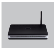
DSL-2640B ALL-IN-ONE WIRELESS G ADSL2+ ROUTER

If any of the items are missing, please contact your reseller.